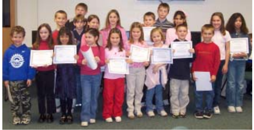
Creative Island Creek students receive their certificates for participating in the Reflections program.

We are happy to announce and congratulate the Reflections entries that were forwarded to the county PTA level: